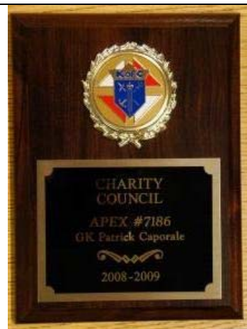
The Charity Council Award