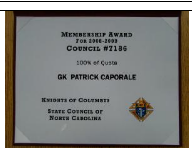
100% of Quota for Council 7186