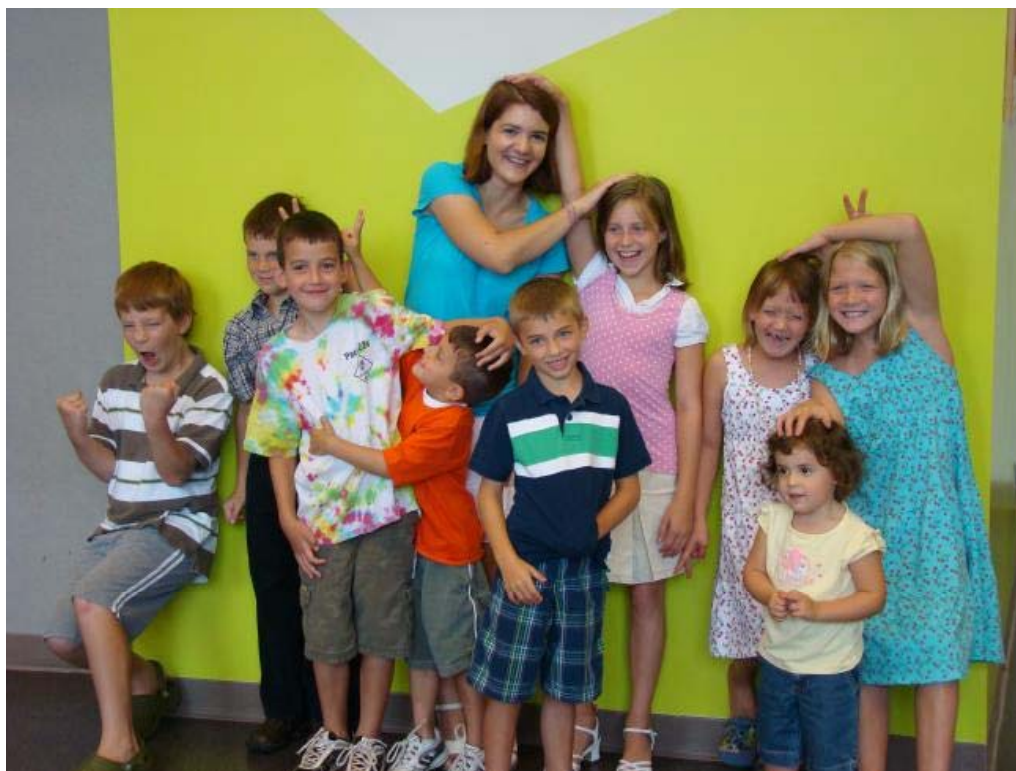
The recipient of the awards in a lighter moment..