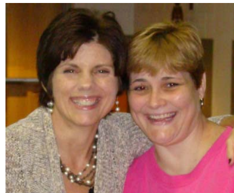
The ladies were a great help.