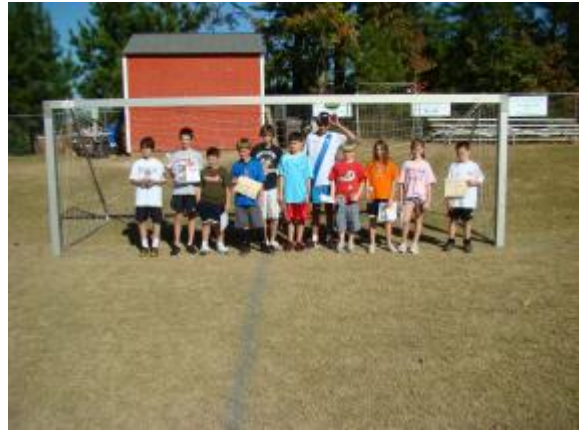
All the Participants