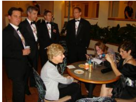
Most of the STMM Crowd from down Low