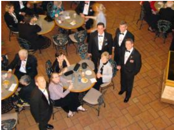
Most of the STMM Crowd from on High