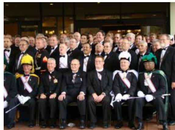
Closeup of the Front Row Yellow = District Master Blue = Vice Supreme Master (out of picture on left) Green = District Marshal Others on front row = Degree team