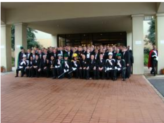
The Class of 2008 A Photo of 160 New 4 th Degree Knights