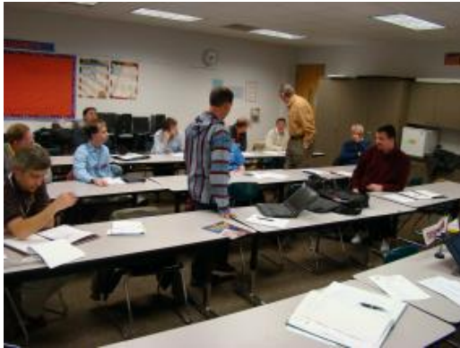
A few of the members present